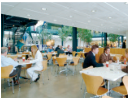
Staff canteen located in Building 2